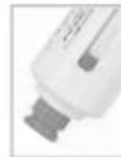
300-400排水口 300-400 Drain Port