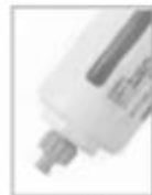
200排水口 200 Drain Port